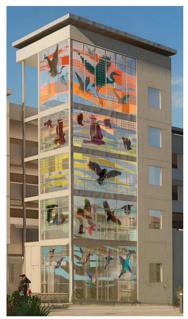
Building image provided by McCarthy Building Companies.